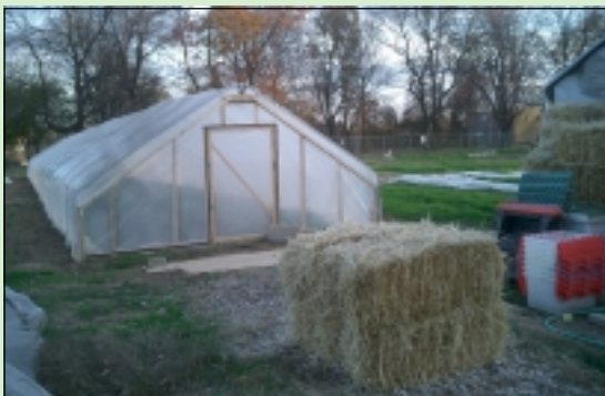
The farm's new hoop house.